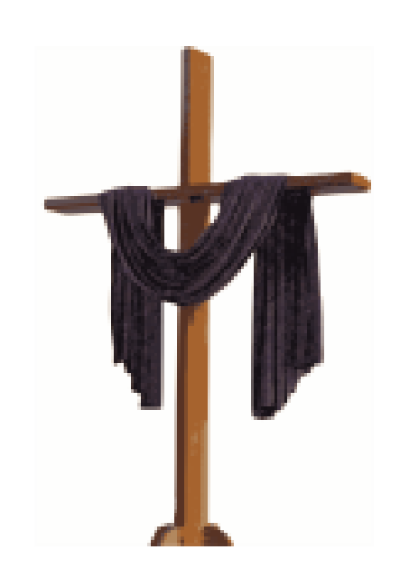
Chaplets Related Prayers Schedules